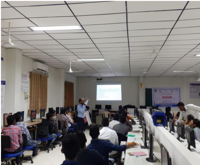
Resource person interacting with students